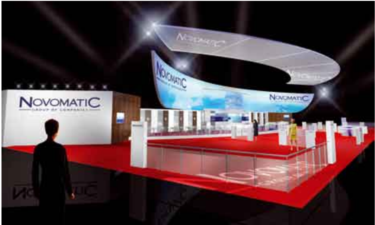
Once ICE opens its doors this booth will be packed with the latest gaming innovations and many hundreds of guests and visitors. A draft for the new Novomatic booth 2011.