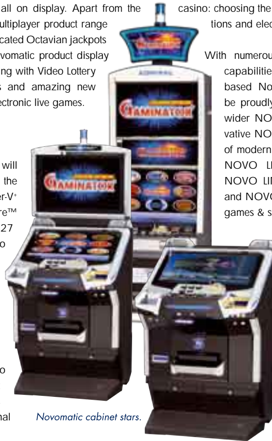
Novomatic cabinet stars.

On the Novomatic booth visitors will find top star cabinets such as the NOVOSTAR® SL2 and the Super-V+ Gaminator® with the latest Coolfire™ II multi-game mixes. With up to 27 games per multi-game mix, up to seven player-selectable denominations, multi-language options as well as a great choice of high/low line-games (5 to 40 lines selectable) these multi-game mixes offer maximum flexibility for the operator and guests alike. The, all new, top game releases to be shown at ICE feature many that are sure to become iconic products and firm favourites with international casino guests.